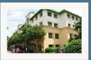
HERITAGE LAW COLLEGE