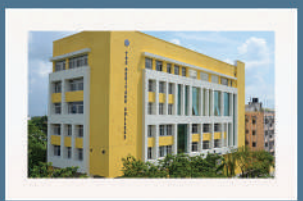
THE HERITAGE COLLEGE