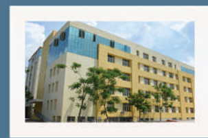
THE HERITAGE ACADEMY