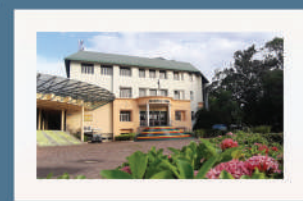
THE HERITAGE SCHOOL