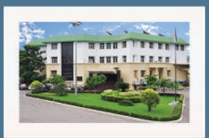
HERITAGE BUSINESS SCHOOL